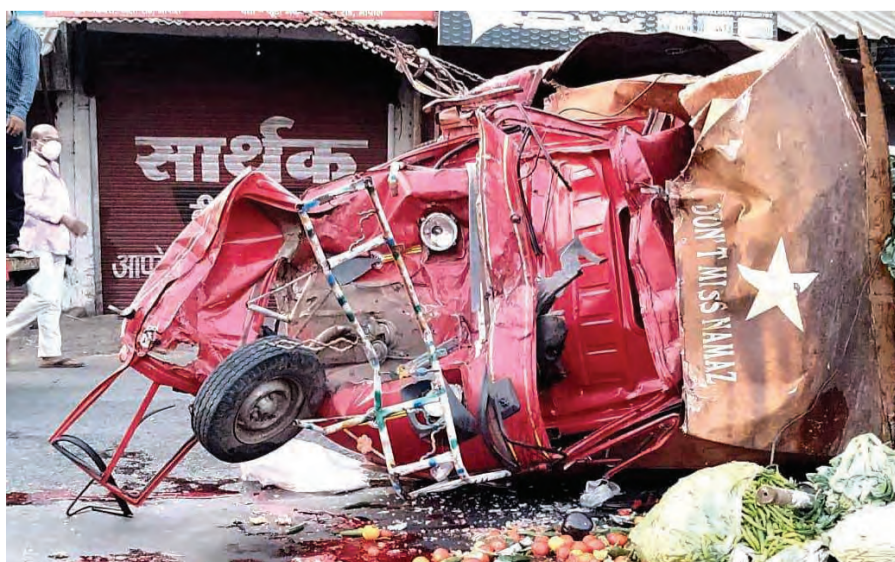
A loaded auto collides with a dumper in Bhopal on Sunday.

governments have signed the RFT and the central government has also generated the FTO, so there is a possibility it is being said that the eighth installment of Kisan Samman Nidhi may reach the farmers' account before May 12.